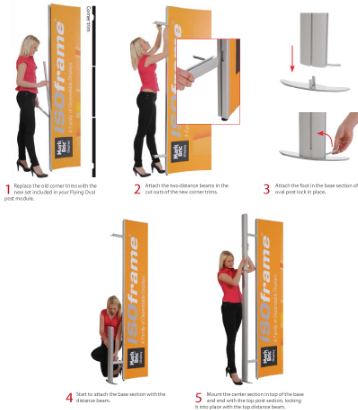
1 Replace the old corner trims with the new set included in your Flying Oval post module.