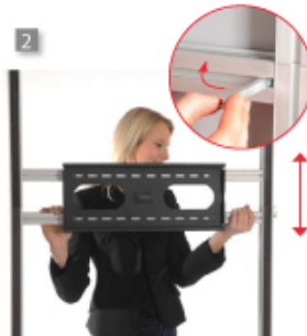
2 Attach the LCD holder in the system with the 4 FASTdamp locks.