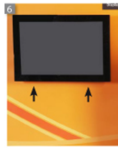
6 Lock the LCD with the two screws in the bottom of the screen rail!