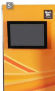
5 Hook on the LCD