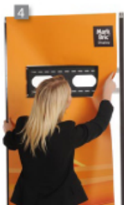
4 Attach the graphic panels